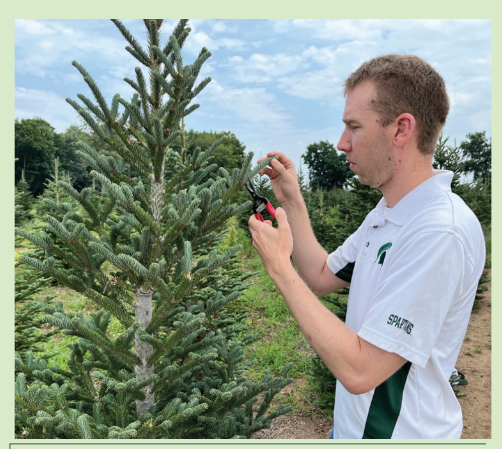
Photo 4 – Tissue sampling current year's growth from top third of tree.

Growers that are interested in finetuning nutrient management can consider adding foliar testing this fall and winter. Foliar testing can be an effective way to determine nutrient levels present in the tree and identify nutrient shortages prior to onset of visible symptoms. This technique is especially valuable during the mid to late rotation of your Christmas tree cycle.