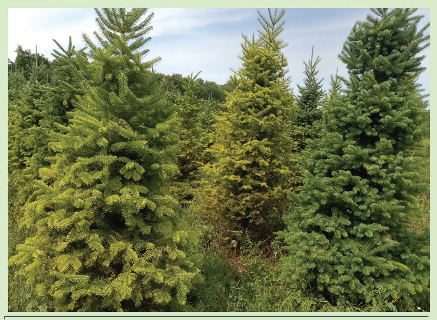
Photo 2 - Yellow needle color trees indicating nutrient deficiency.

submission (1 shoot per tree). Separate samples should be submitted for trees of different ages or species. Samples should be mailed to a diagnostic testing laboratory, indicating on submittal form that the samples are from Christmas trees and tree species grown.