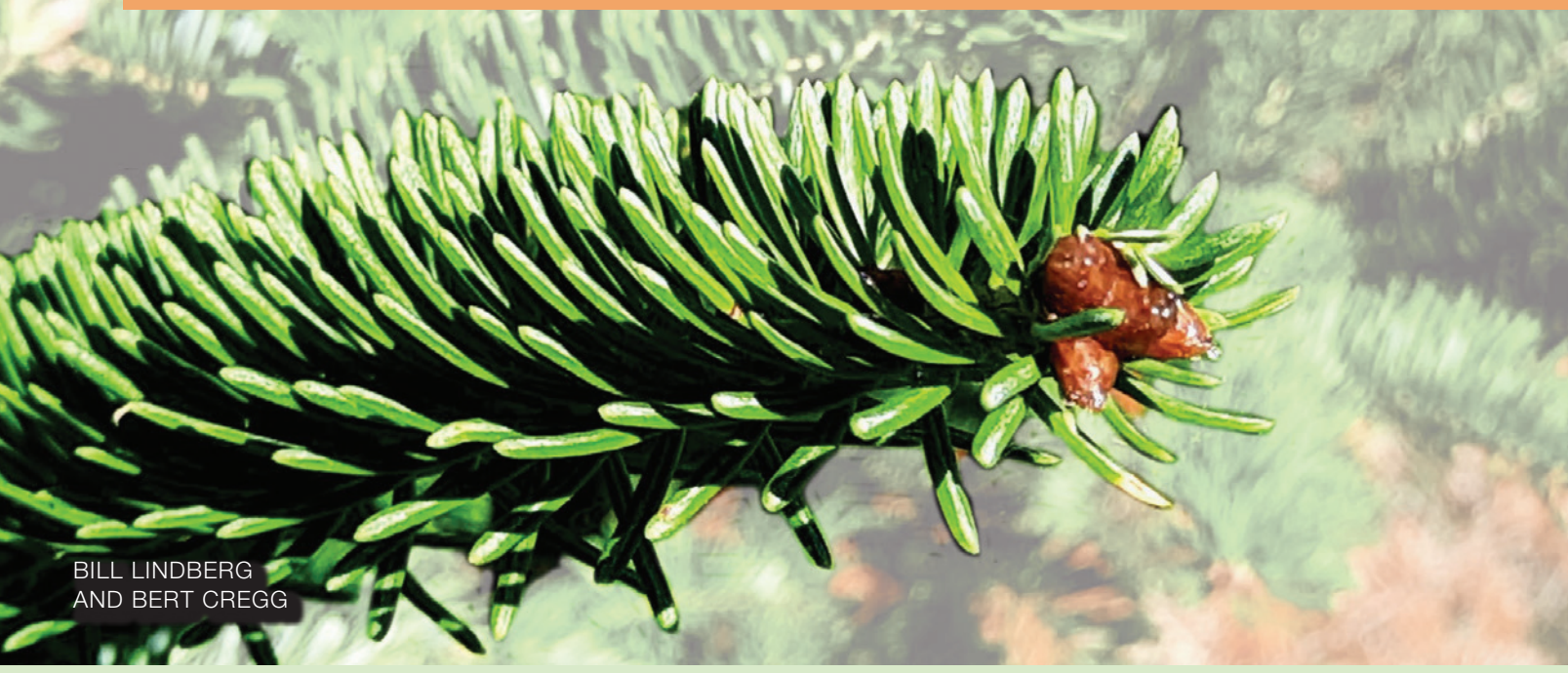
Photo 1 - Tree with adequate nutrition showing good growth, bud set, and needle color.

Questioning whether your trees are growing as well as they could? Foliar testing can be a powerful tool to determine nutrient status.